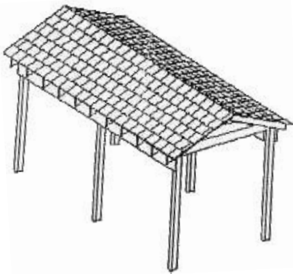
Boat Cover Model One (1)